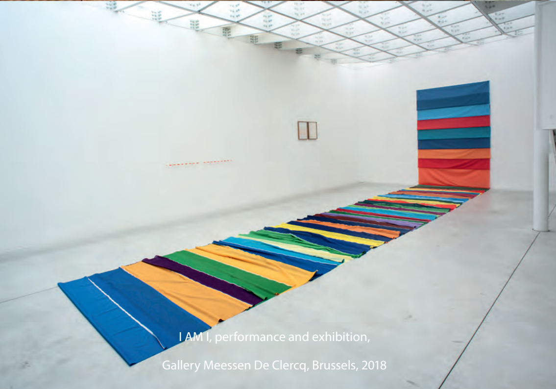
I AM I, performance and exhibition, Gallery Meessen De Clercq, Brussels, 2018