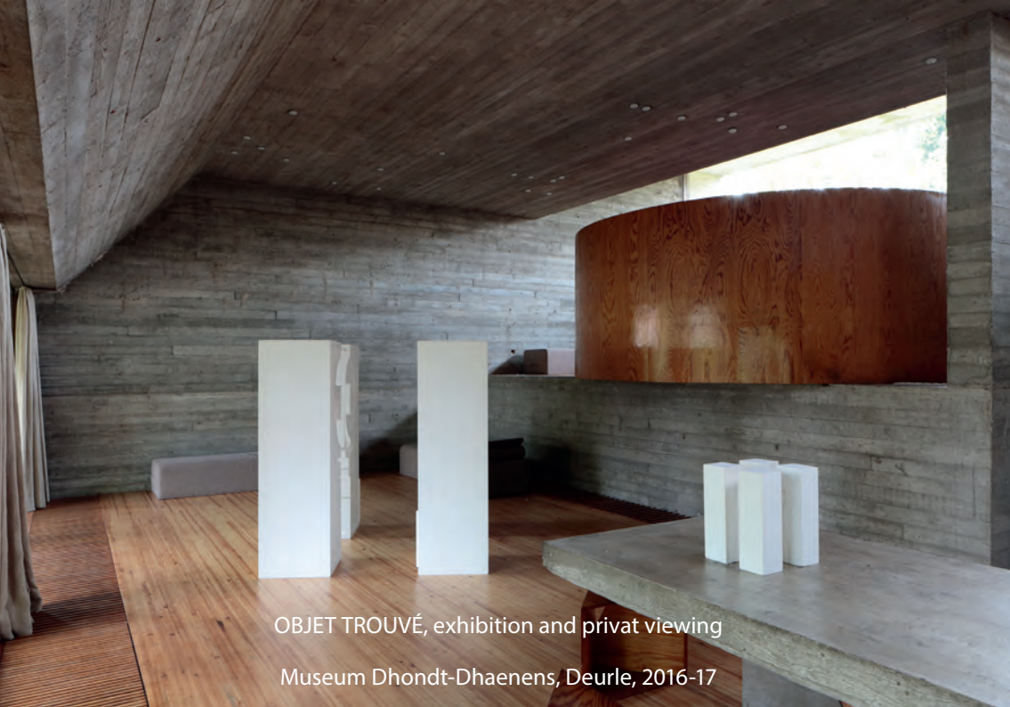
OBJET TROUVÉ, exhibition and privat viewing Museum Dhondt-Dhaenens, Deurle, 2016-17