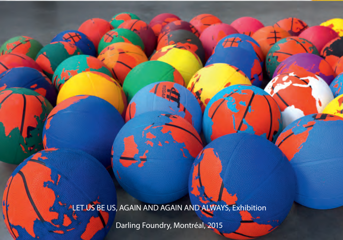
LET US BE US, AGAIN AND AGAIN AND ALWAYS, Exhibition Darling Foundry, Montréal, 2015