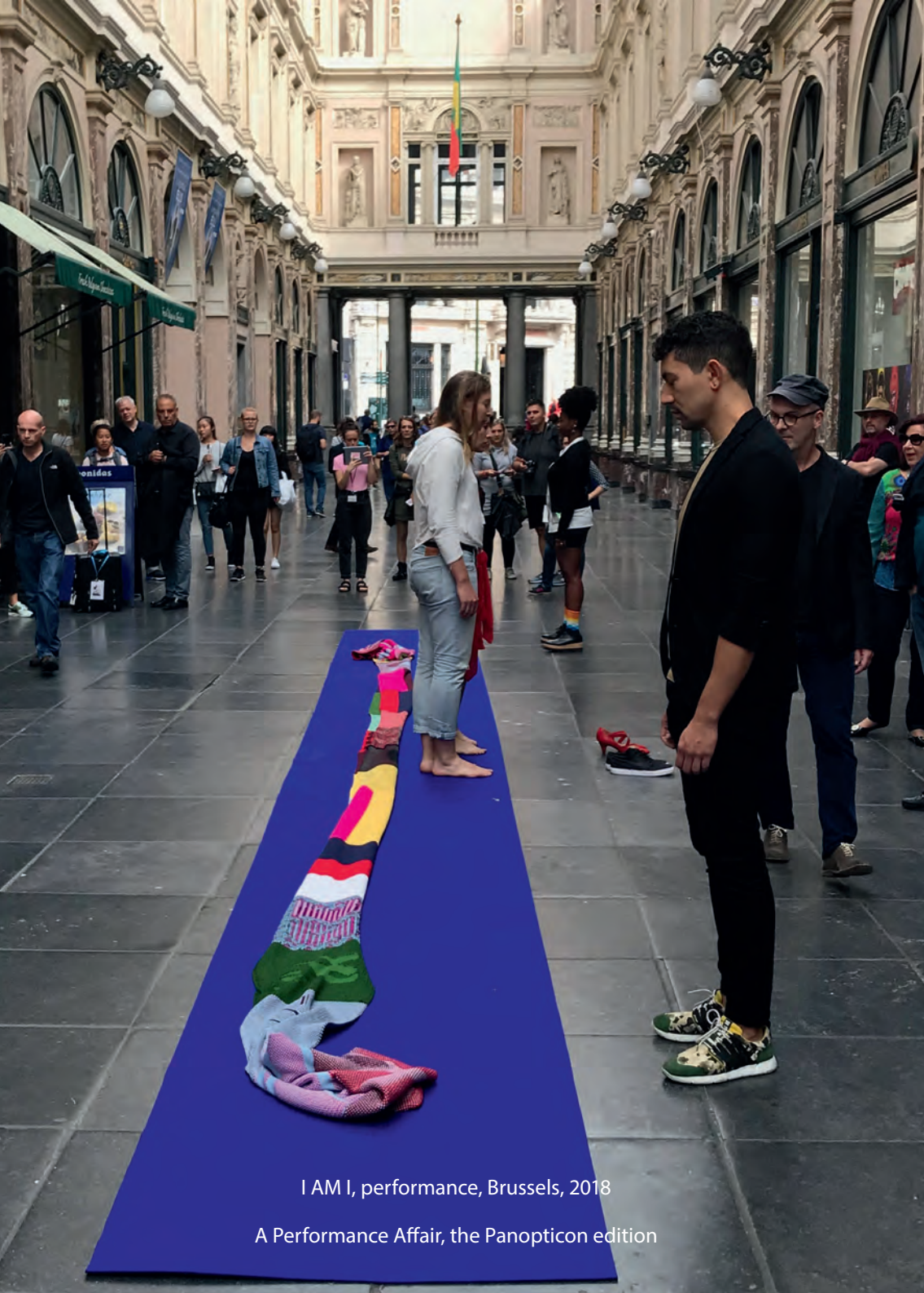
I AM I, performance, Brussels, 2018