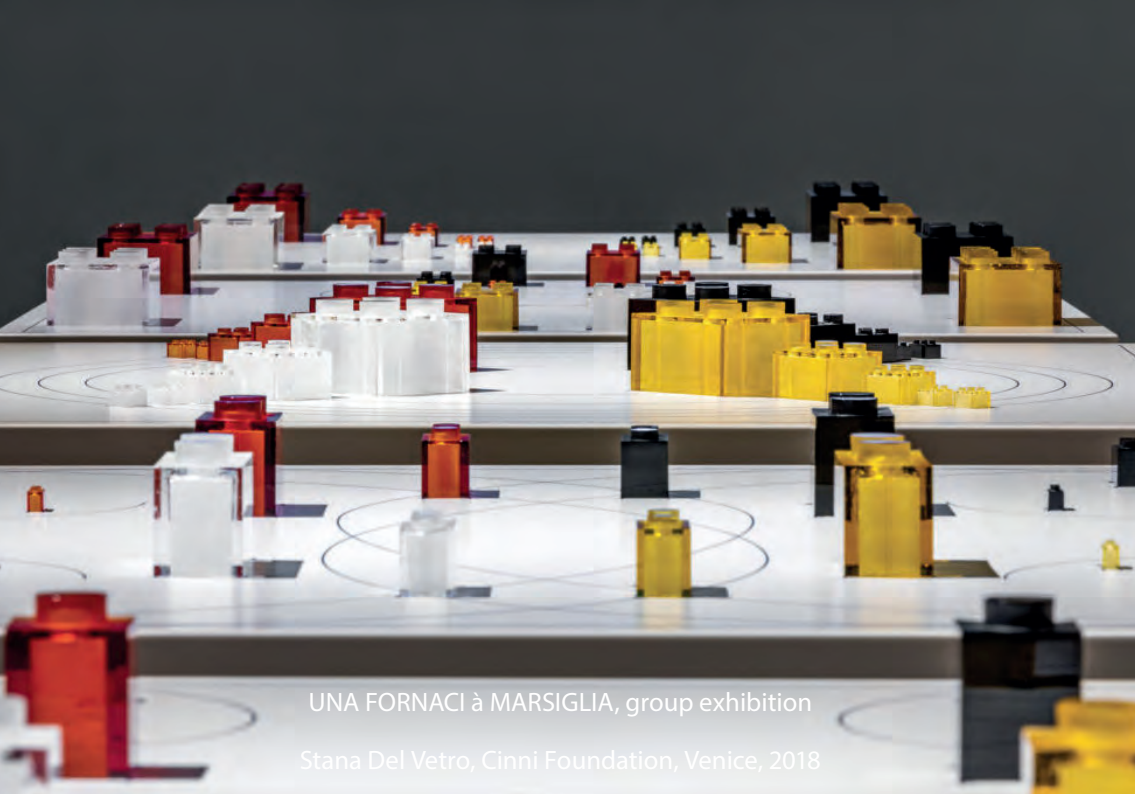
UNA FORNACI à MARSIGLIA, group exhibition Stana Del Vetro, Cinni Foundation, Venice, 2018